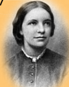
Octavia Hill 1838 - 1912