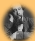
Charles Dickens 1812 - 1870