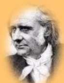
John Pounds 1766 - 1839