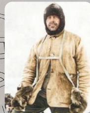
Robert Falcon Scott